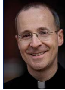
Fr. James Martin